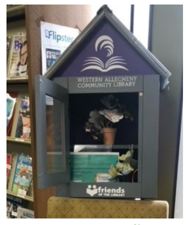
1271 Route 30, Clinton

Little Free Libraries are a way to bring books into the community without having to visit the library. All of these LFLs are regularly stocked and rotated with new material. Anyone may contribute or take books. The more the merrier! If you take a book (or two) from a library, you do not need to return that book. However, residents are encouraged to add a book they may have finished to the LFL for someone else to enjoy.